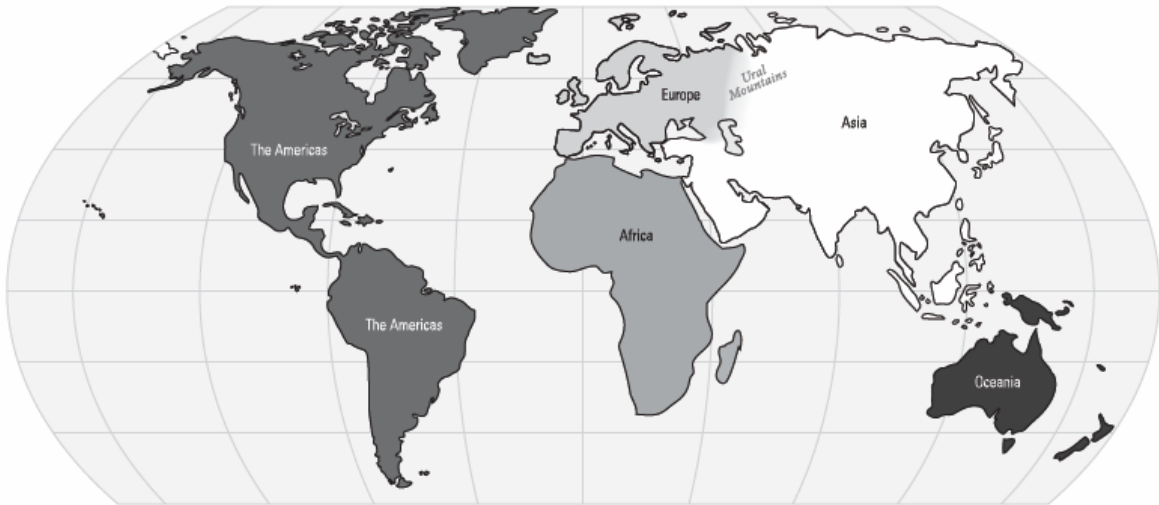
AP World History: World Regions — A Closer Look